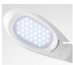
High quality LED beads flashless without radiation